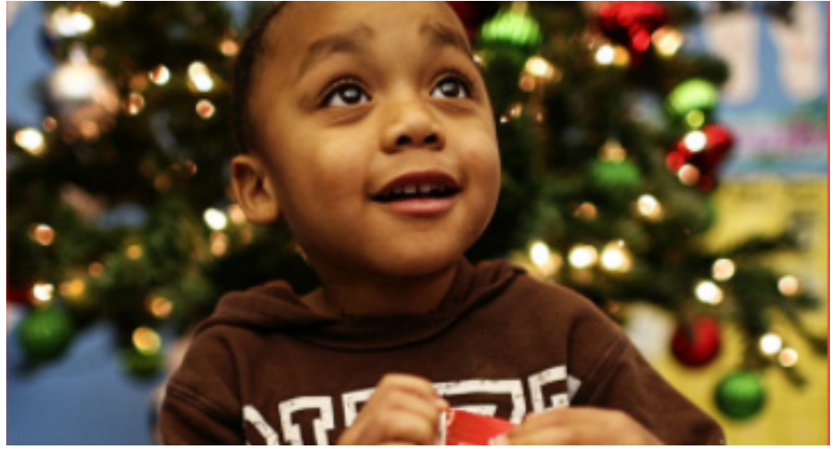
Each tag represents a child in need of a gift. It will specify whether the child is a boy or a girl, their age, and gift ideas. Each tag ideally includes 2 gifts.

The Angel Tree program is a program led by the Salvation Army, that provides a holiday to tens of thousands of families each year! For most of these children, the gifts they receive through Angel Tree are the only ones they will open on Christmas.